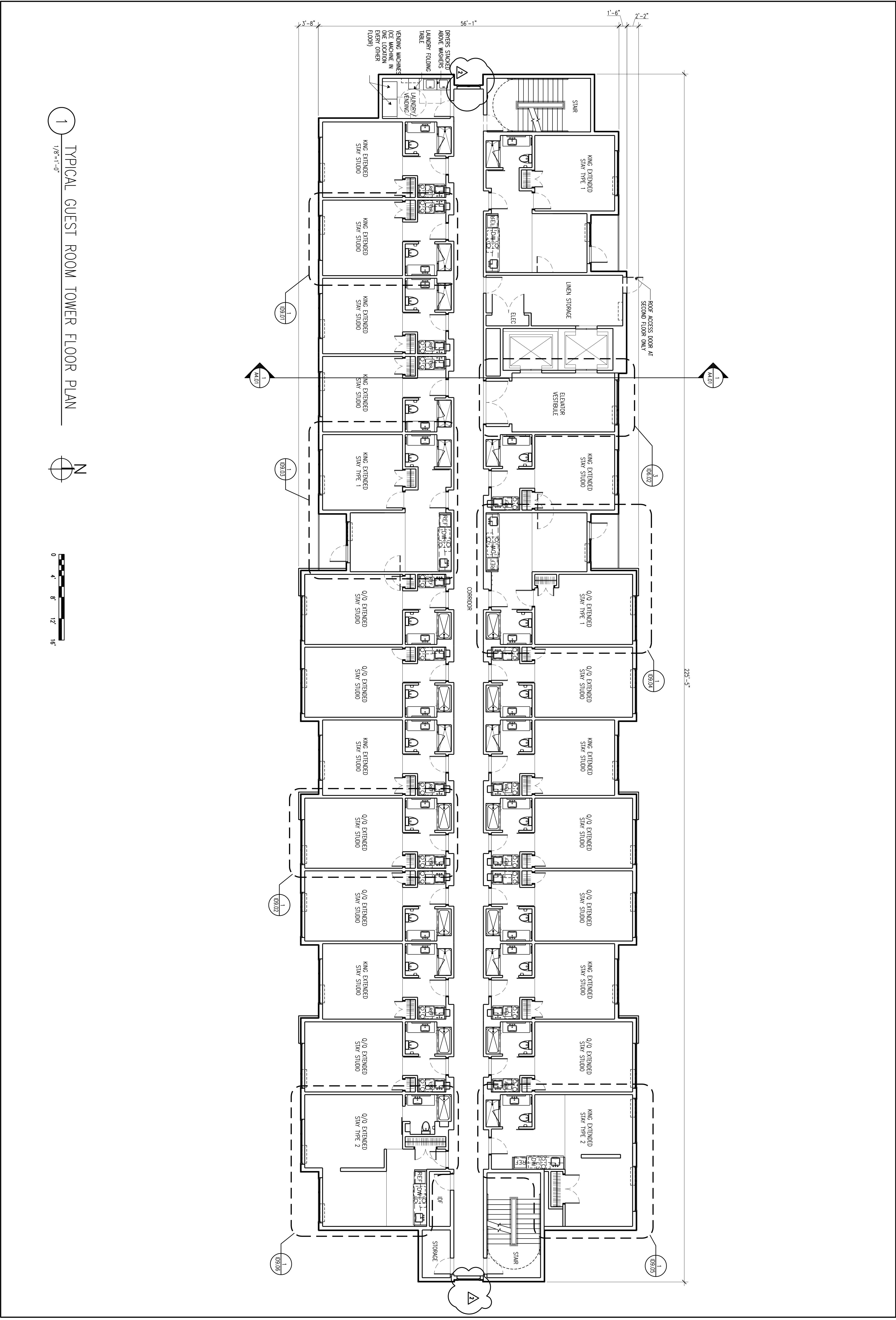
1 TYPICAL GUEST ROOM TOWER FLOOR PLAN 1/8"=1'-0"